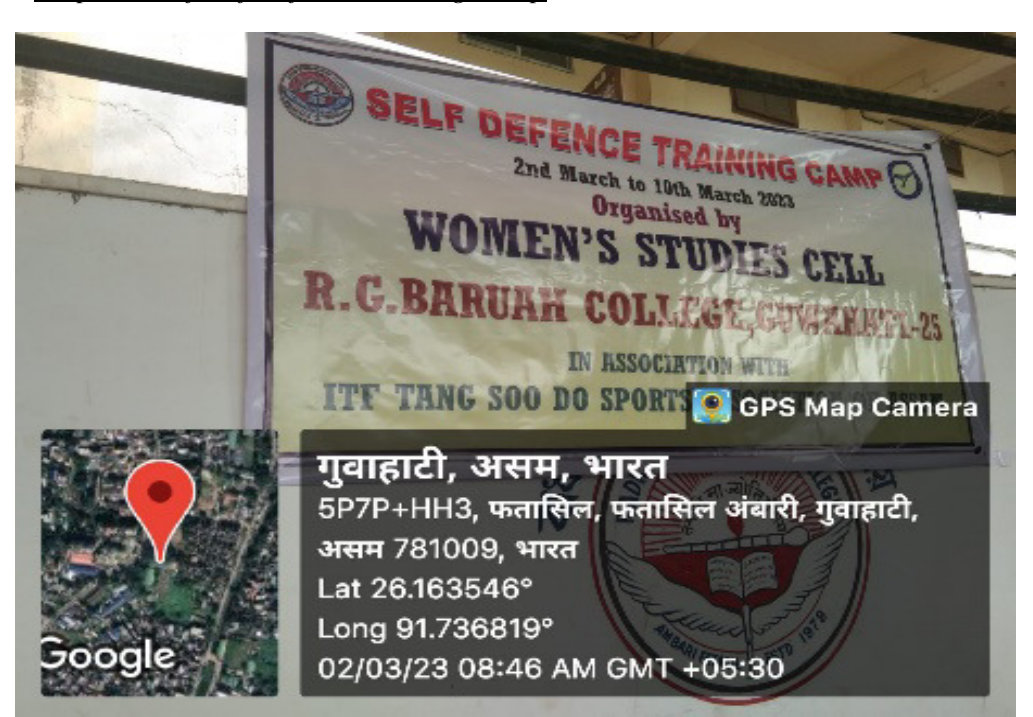
Snap Shots of Self Defence Training Camp